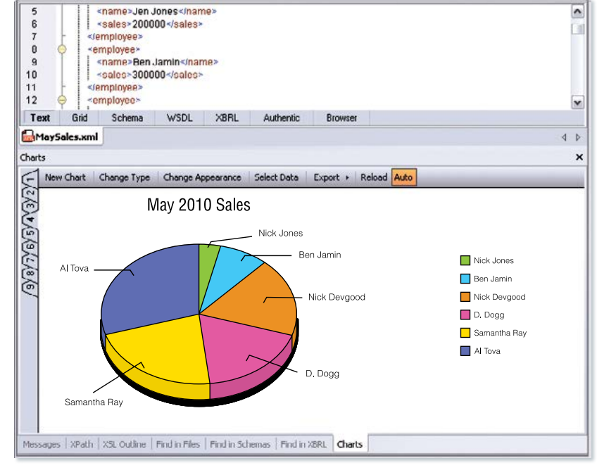
Chart creation from XML data